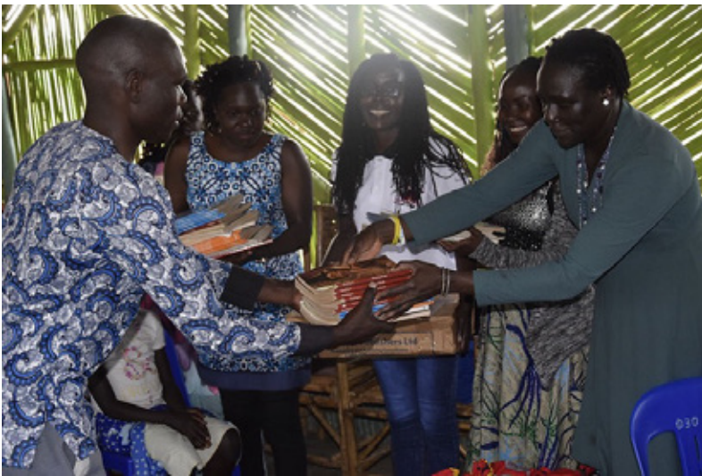
LWA members donating books to Okere Community School

Very importantly, the team also donated 200 books to our community school. The books will go a long way to enrich our community library and enable the children in Okere to access quality learning tools.